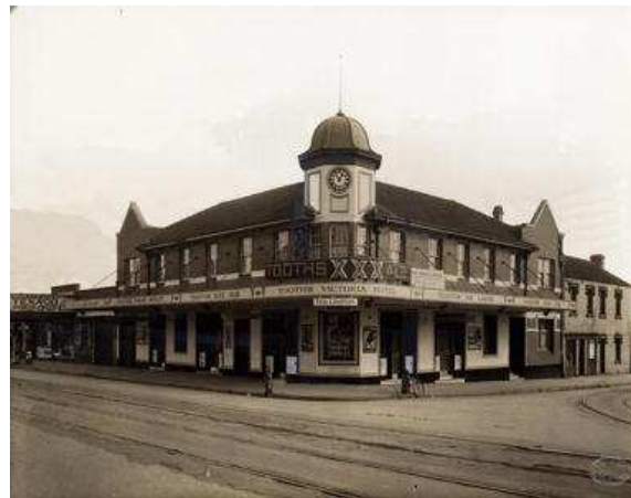
The Victoria Hotel, Enmore (1936)