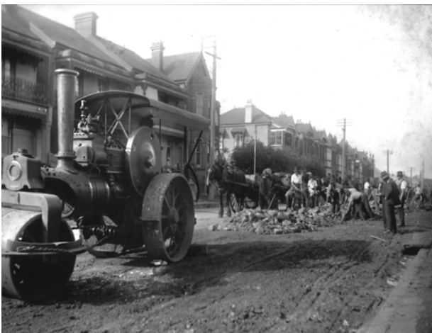
Stanmore Road (1925)

The first Norfolk pines on the Australian mainland were planted along the line of Percival Road, leading to Parramatta Road, by Lt Colonel George Johnston. He was the owner of Annandale House, built in 1799 on the hill between Macaulay and Albany Roads, Stanmore. From here Johnston marched with his troops to Castle Hill to quell the convict revolt on 5 March 1804, and again on 26 January 1808 to arrest Governor Bligh during the Rum Rebellion.